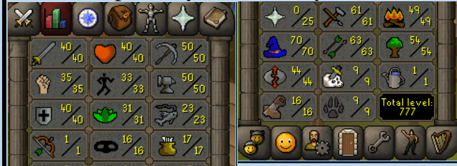
Add me: Lizardlover

What started as an innocent attempt to bask in some late-2000s nostalgia and hang out with my siblings has devolved into a second gaming timesink. For the past month or so, I've been working toward the quest "Lunar Diplomacy." Behold my sick stats: