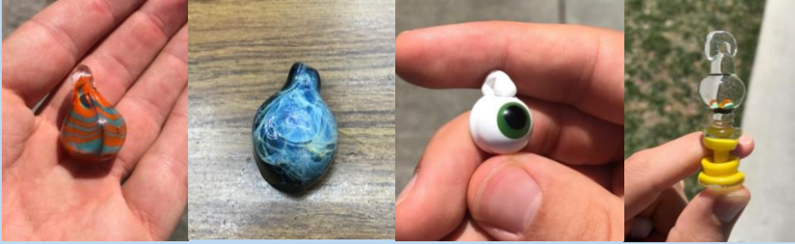
Left-to-right: mixed color pendant; fumed glass teardrop; eye; imploded bishop

This summer I decided to pick up a new skill: flameworking. Basically it's manipulating rods of glass into pretty shapes by means of a gas flame. I took Glass Pendants, a class at the Davis Craft Center. These first pieces are rough, but I think if I drop enough time into it I'll git guud.